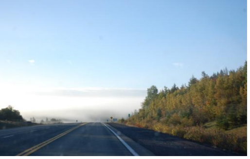
Our life though a windshield