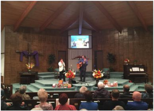
Salem Baptist Church, Sackville, NB