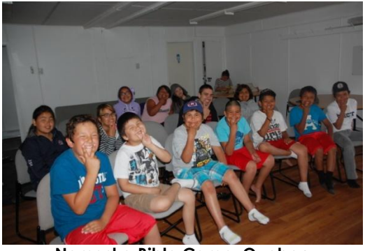
Nemaska Bible Camp, Quebec