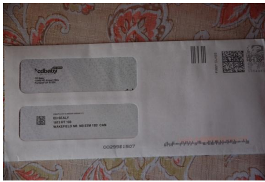
First internet income from music downloads