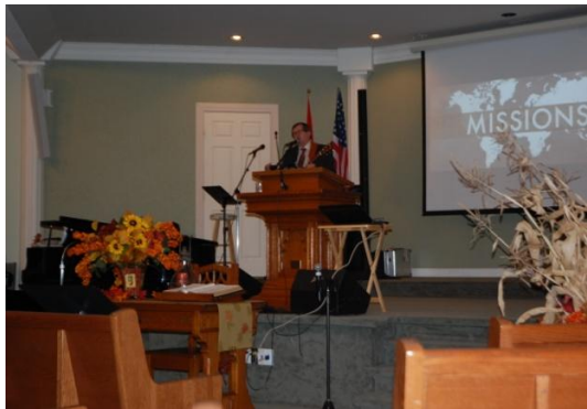
Little South West Missions Conference