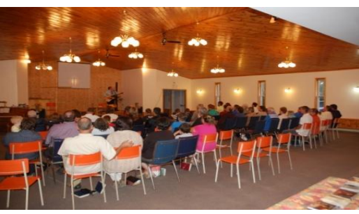
Guiding Light in Shag Harbour, NS