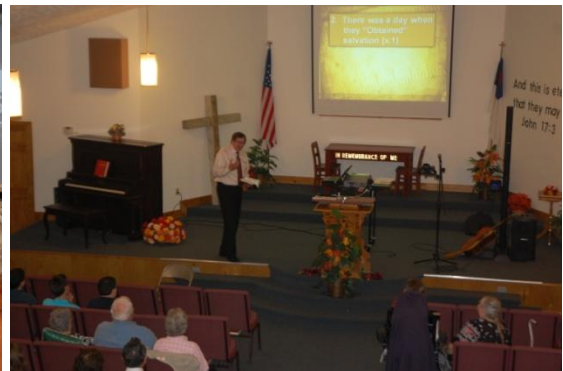
Bucks Harbour Missions Conference