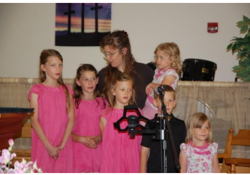
Eastport, ME with the Mumfords