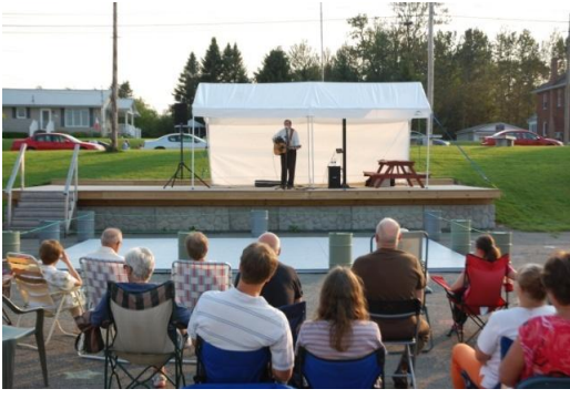
Outdoor Concert Madawaska, ME area