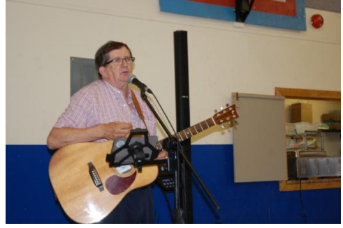
Hampton, NB for Community Outreach