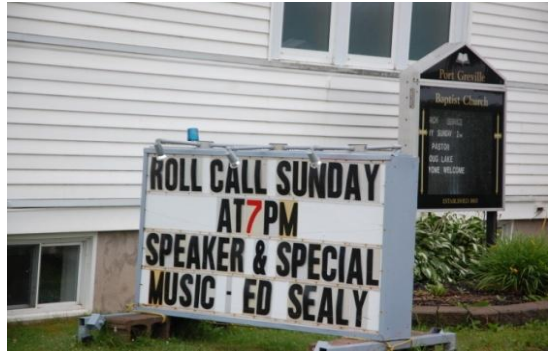
Port Greville, NS