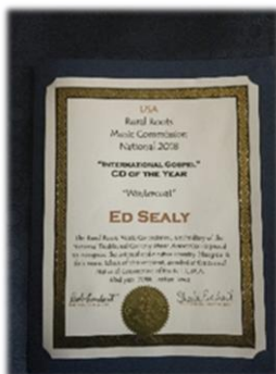
International CD of the Year