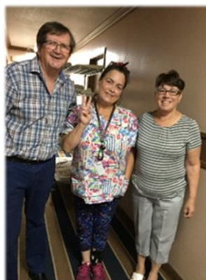
She gets Autograph, CD and the Gospel