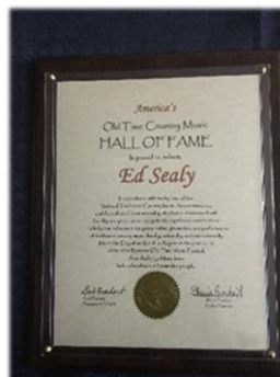
Hall of Fame Induction