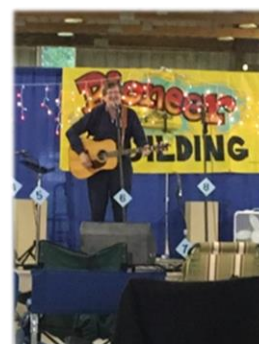
On stage 5 times