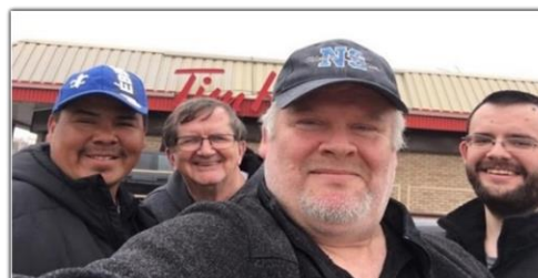
Ottawa, ON Man on Left Just Got Saved