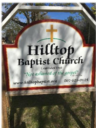
Church Outreach in Maine