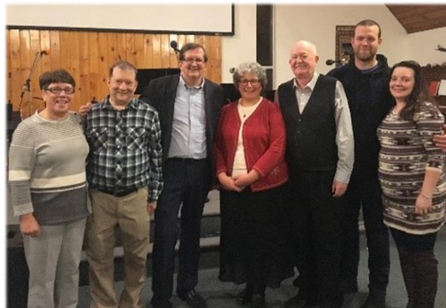
Maranatha Bible Church NS