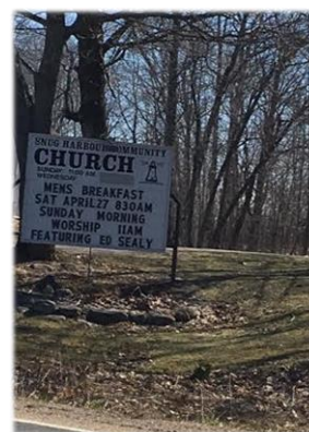
Snug Harbour, ON