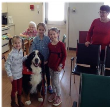
Grandkids Just Sang at Seniors Concert