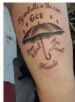
Ed's Song is a Tattoo For a Fan