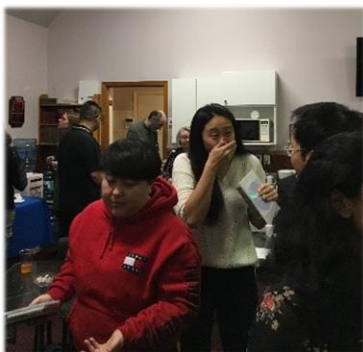
International Coffee Shop