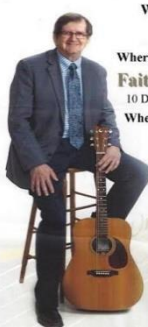
Meetings in Cape Breton, NS