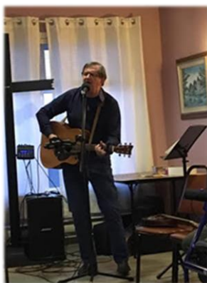
At Nursing Home