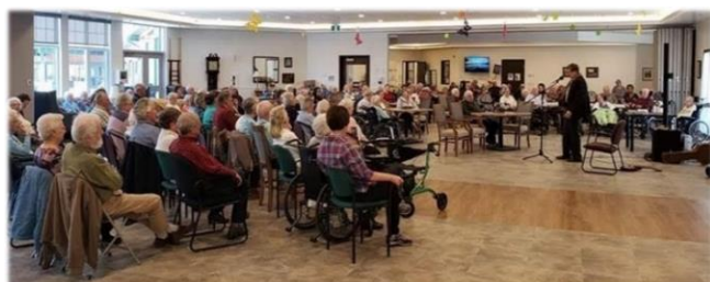
Grace Village Sherbrooke, QC